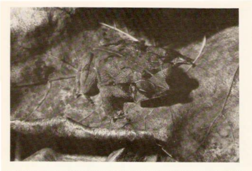
Fig. 1: Bufo margaritifera Laurenti, male from Zanderij, Suriname (field no. MSH 1975-325, in Nationaal Natuurhistorisch Museum [RMNH]).